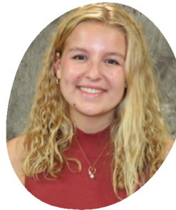
Molly ACES Committee