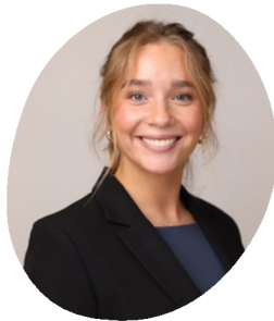
Abby ACES Committee