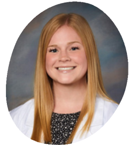
Grace ACES Committee